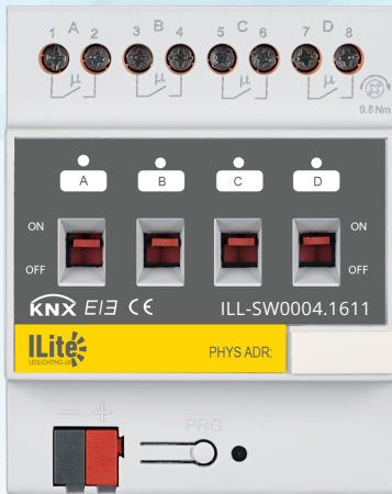
4 Fold 16A Switch Actuator